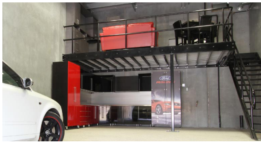
Nearby industry includes STEP Energy, Viva-Deli, OK Tire, PL Customz, Castle Guard Storage and Rotor-Tech Canada.

Now selling Phase 3 units! Twelve new units are ready for occupancy. Lease options are also available. The property is paved and landscaped and has a security fence and gate.