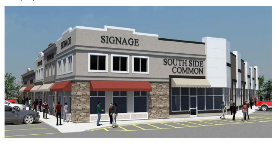
For more information visit:

Site preparation and construction has commenced.